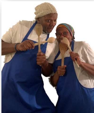
Beresford Founder—Rice & Peas

Create positive action to hold the system responsible, not judging individuals.